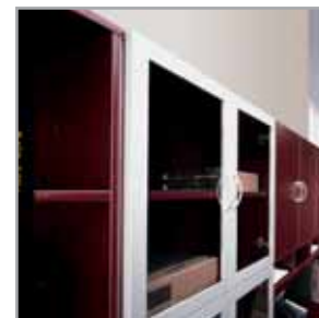
Doors are also available with an aluminum frame (finished in Silver or Black Nickel) with clear glazed inserts, frosted glazed inserts, or rice paper glazed inserts